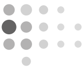
Figure 3: »Vicious and Virtuous Circles« of Trade Union Strength