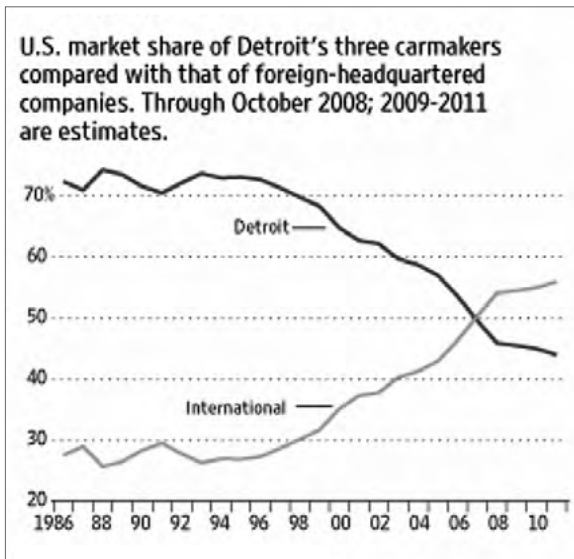
Figure 2: Changing Lanes