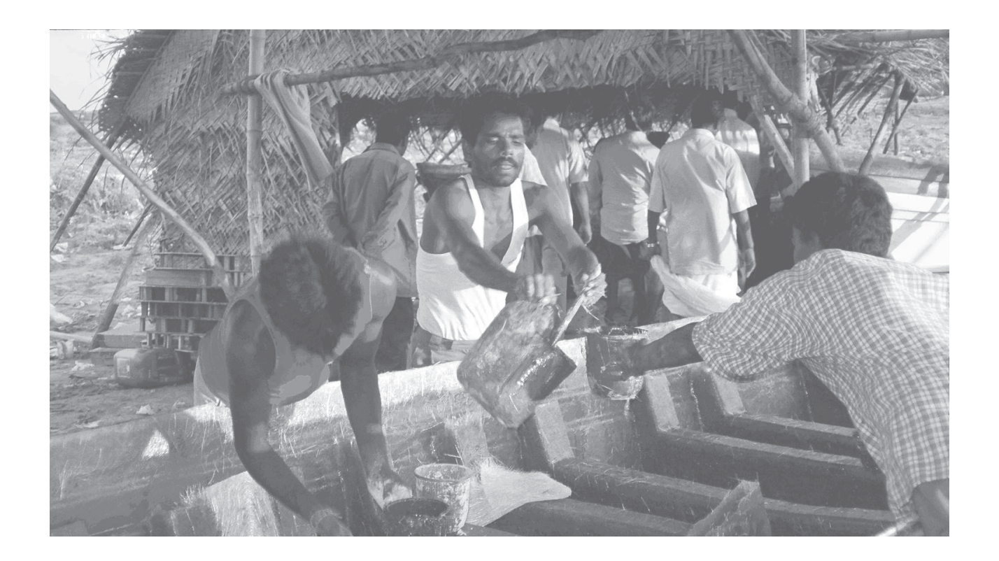
The Politics of Aid – Post Tsunami Reconstruction and Conflicts in India