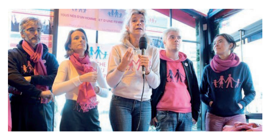
The comedian Frigide Barjot supporting the French demonstration 'La Manif Pour Tous', which opposes marriage for everybody. Diversity is not welcome!

Following the homophobic and genderphobic marches, the UMP - no longer the governing party - suddenly came out against the integration of gender theory in schoolbooks. In 2013, after the major homophobic parades, the party even filed a complaint against the law opening up marriage, which had already been adopted by the National Assembly. The