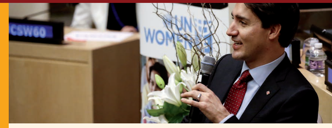
Canadian Prime Minister Justin Trudeau has appointed women to half of the posts in his cabinet, making Canada fourth in the international ranking of countries with the highest proportion of women in ministerial offices.