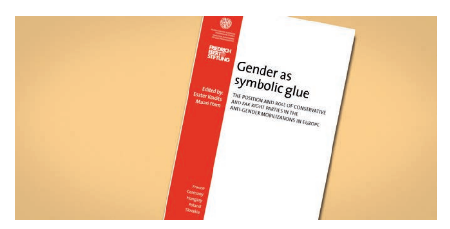
The anthology 'Gender as symbolic glue' (http://bit.ly/1VQY5dT) compares anti-gender movements in France, Germany, Hungary, Poland, and Slovakia.

The post-modern approach to science – politically informed, critical, and interdisciplinary – has led to new concepts. Previously marginalised actors, who represent a critical perspective, such as the gender perspective, now