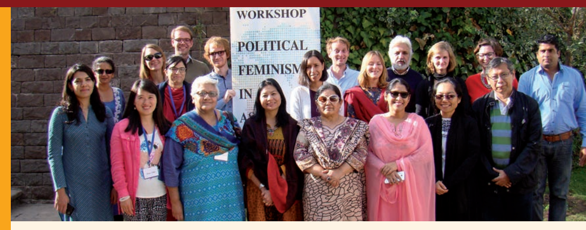
Experts from six countries took part in a debate in Pakistan about Political Feminism.