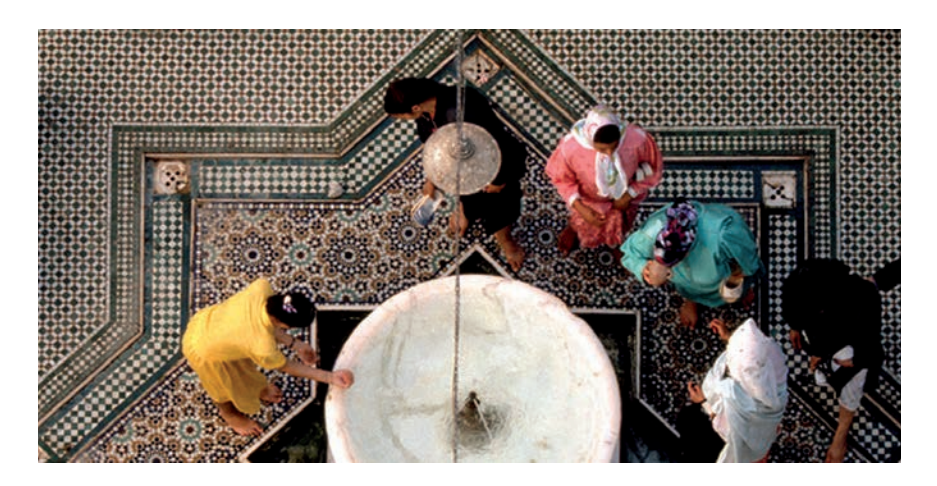
Appeal at the FES Conference in February 2016: recognise diversity within Islam, fight against stereotypes.

In the expert forums, the speakers reported on the current social reality of Muslim women in their own countries. It became clear that the debate about the headscarf is a recurrent theme in all immigration societies, which reveals much about the social status of Islam in each of the countries.