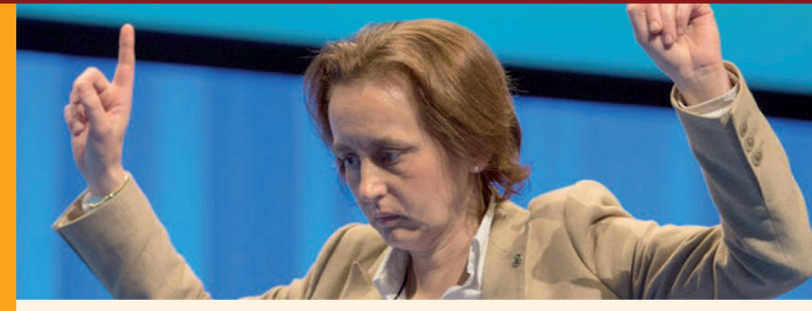
Beatrix von Storch represents the right-wing populist AfD in the European Parliament.