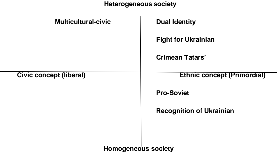
Figure 1. Map of the narratives

This map places the “Dual Identity Narrative”, “Crimean Tatars’ Narrative” and “Fight for Ukrainian Identity” narrative in the heterogeneous society/ethnic concept quadrant. The “Pro-Soviet” and “Recognition of Ukrainian Identity” narratives are placed in the homogeneous society/ethnic concept quadrant; and the “Multicultural-Civic Narrative” is placed in the heterogeneous society/civic concept quadrant. This mapping has several advantages: it provides an opportunity to place all narratives on the map and to recognize what narratives are missing in the society. The map shows that five out of six narratives rest on a primordial ideology and employ ethnic concepts in the development of the national idea. Only one narrative, the “Multicultural-Civic” one, represented by 16% of respondents, is based on a liberal ideology and civic meaning of national identity. Nevertheless, this narrative recognizes the ethnic diversity of Ukrainian society. Thus, the intellectual landscape of Ukraine is deficient in civic liberal ideologies that define society as a community of equal citizens independently of their ethnicity, language, or religion.