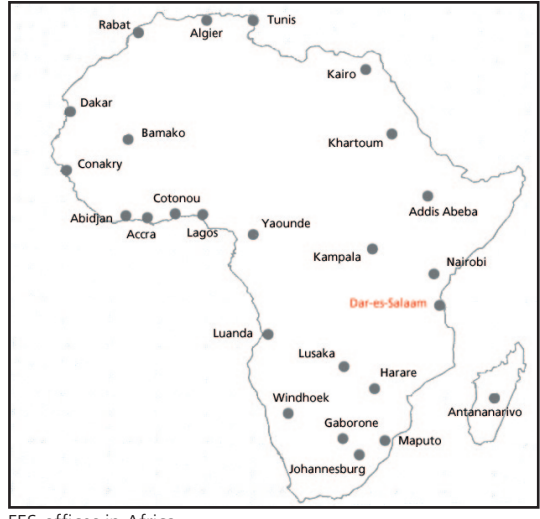
FES-offices in Africa

Sub-Saharan Africa and especially East Africa has always been in the focus of FES' international efforts. We will further on help to stabilize and deepen the democratic process in many African countries and try to influence economic and social change.