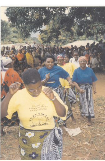
Para-legal unit theatre group

FES Tanzania is raising women's awareness about their rights, supporting the process towards gender equity in the country and implementing FES' and partners' activities with a gender perspective.