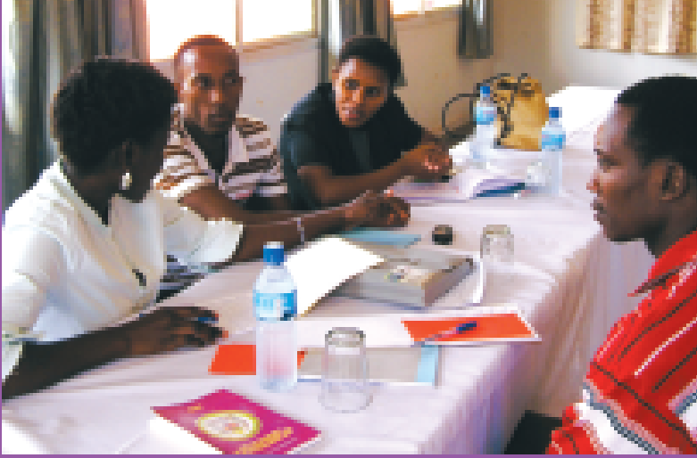
Some of the YLTP V trainees in a group discussion during the second summer school held at Oasis Hotel, Morogoro, 2006.

development has been unequivocal. Germany's international campaign for fair trade has been loud and its support for the Cotonou Agreement signed under the ACP-EU relationship has been relentless.