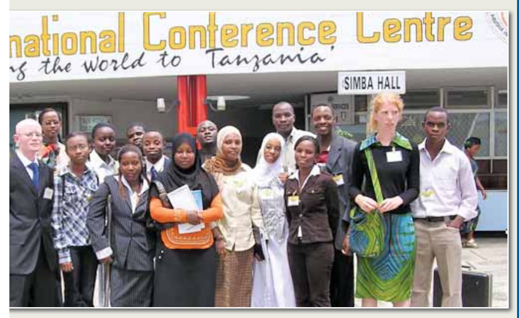
ificant teaching methodologies applied in the YLTP. Pictured are the YLTP VI trainees during their excursion ernational Criminal Tribunal for Rwanda (ICTR) and the secretariat of the East Africa Community (EAC).