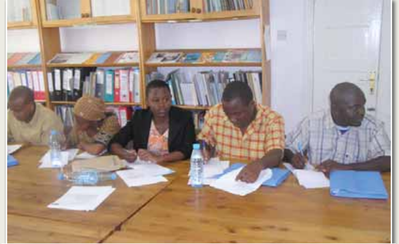
Some of the YLTP VII trainees in one of the training sessions held at FES Conference Hall, Dar es Salaam. The venue provides the trainees with various resource materials for reference.