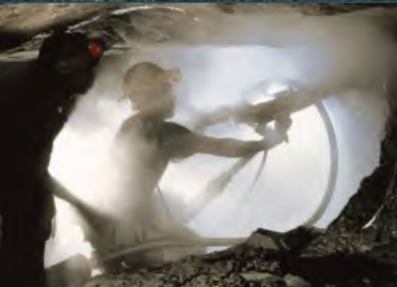
Up: Lonmin platinum mine