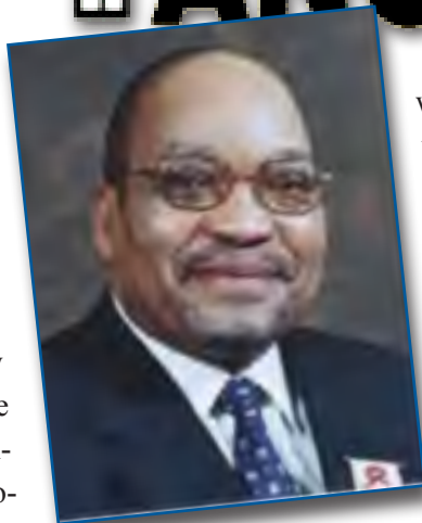
Jacob Zuma, ANC-President