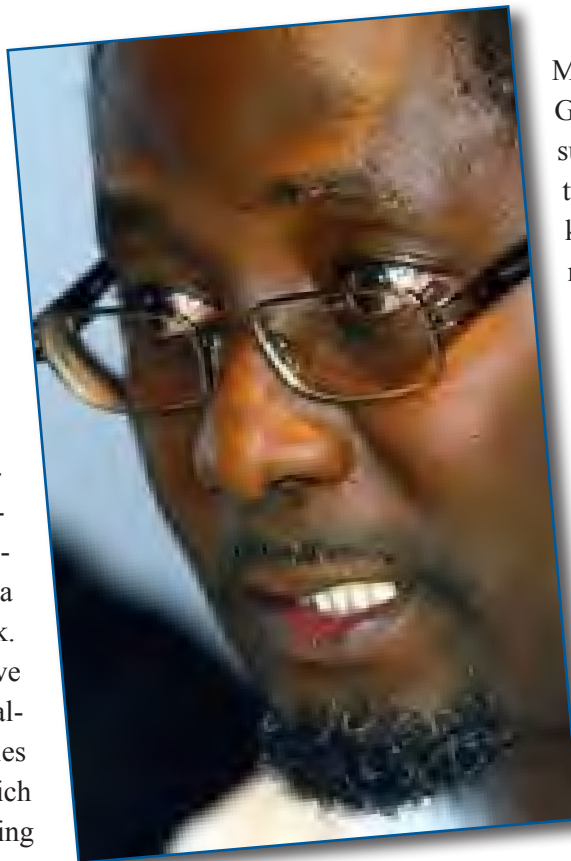
Zwelinzima Vavi, COSATU General-Secretary

ANC Chairperson, Jacob Zuma, demonstrates similar intentions, and remains, nonetheless under heavy pressure from international investors and South African businesses. Even when President Thabo Mbeki resigned from office, Zuma did call for a change of control of the Ministry of Finance or the Central Reserve Bank. Instead, together with interim president Kgalema Motlanthe, it was decided to focus on continuity. A current study conducted by the South African Institute for Race Relations indicates that no dramatic changes in economic policies can be expected after the elections. The study compares the speeches delivered by the most important ANC politicians, including Jacob Zuma, Kgalema