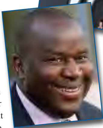
* see end of the page