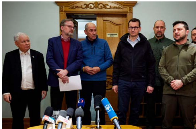
PM Janša with other EU leaders during the visit to President Zelenskyy in Kyiv

While leaders of eight Eastern European EU Member States, including Slovenia and Bulgaria, wrote an open letter urging other members to start the process of accession talks with Ukraine, a spokesperson of the Austrian Foreign Ministry stated in March a “fast-track” or “immediate” accession process “is not foreseen in the EU treaties” and urged for finding alternative solutions for deepening ties with Ukraine, indicating a wider reluctance to the quick entry of the three new applicants.