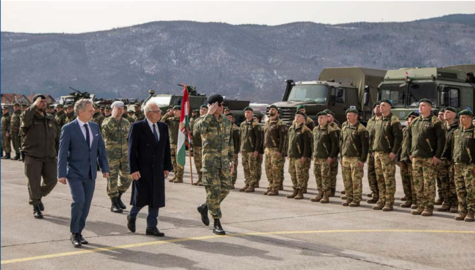
Visit of High Representative Borrell to EUFOR Camp Butmir, Bosnia and Herzegovina

In addition, the Western Balkans has now been peaceful for a relatively long time, despite challenges, due to already intense Western policies of peacebuilding and to political, security, and economic investments of the West into that region. Finally, the inclusion of the Western Balkans 25 years since the second to last war in Europe would be fair to the Balkans and good news to Ukraine too. It would show that post-war recovery is possible and that Europe cares about long-term prosperity, as well as the status of countries affected by war. But Europe needs