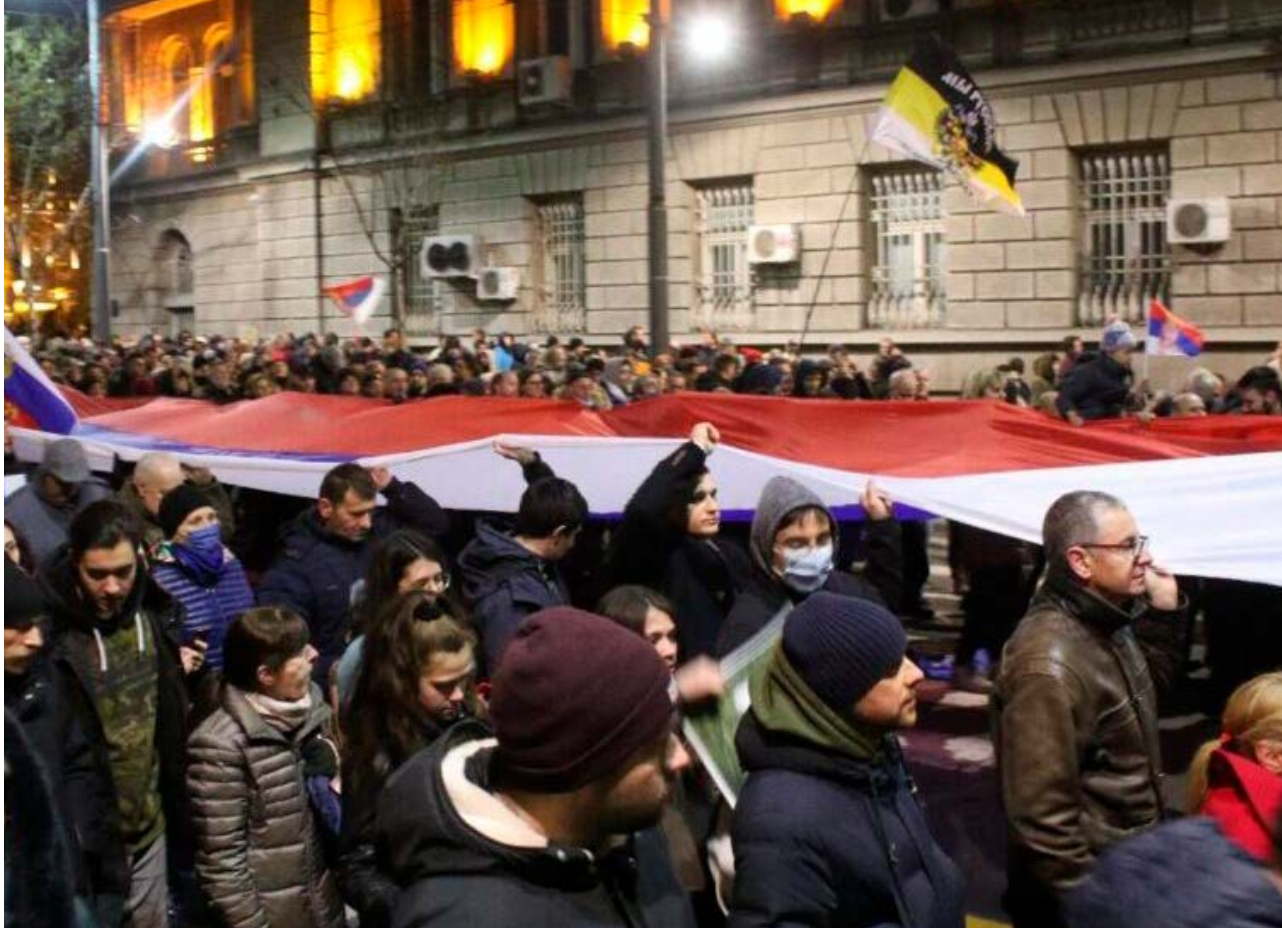
Protests in support of Russia in Belgrade, March 4 th 2022

cessionist forces in the RS entity, in conjunction with (in)direct support from neighboring Serbia, are significant. Indeed, both Russia and Serbia have spent much of the last decade clearly signaling their ability to do just that with frequent “visits” to BiH Russian and Serbian para-criminal and paramilitary elements, such as the Night Wolves, 10 members of “Srbska Cast”, 11 and various “former” Russian 12 and Serbian security officials 13 and militants.