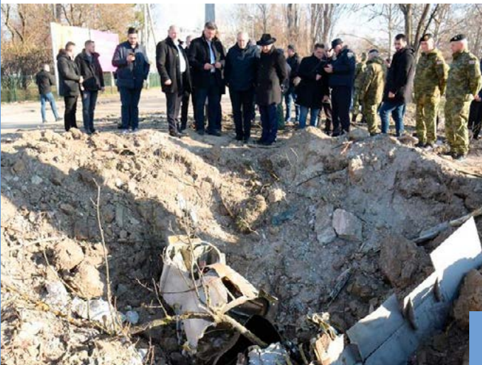
PM Plenković inspecting the drone that fell in Zagreb

On the day the war broke out, European Union announced it would nearly double the size of its peacekeeping force, EUFOR Althea, in Bosnia by sending in 500 reserves as a precautionary measure to stave off any instability. "The deterioration of the security situation internationally has the potential to spread instability to Bosnia and Herzegovina," the European Union's EUFOR force said in a statement on February 24 th . The deployment of additional EUFOR forces was completed by the first week of March. No serious threat of conflict has taken place since.