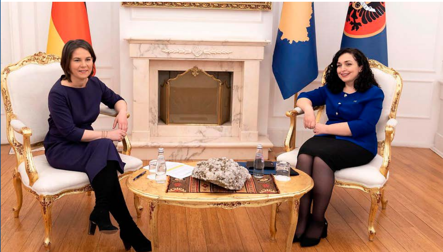
German Foreign Minister Annalena Baerbock in Pristina with the President of Kosovo Vjosa Osmani

This approach would be nothing new. It would also not be a quickly designed policy goal but something that was tried and worked many times before. Having the prospect