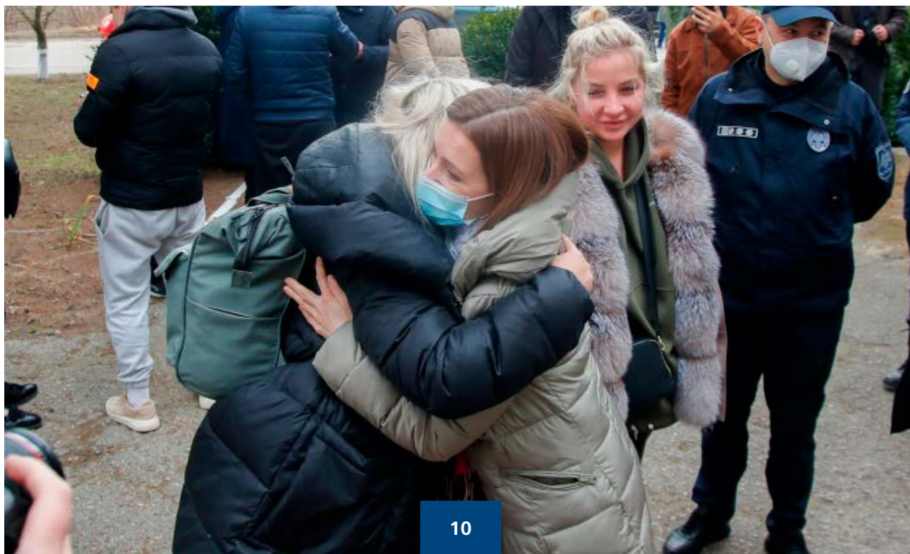
President of Moldova Maia Sandu welcoming refugees

Romania's entry into the EU and NATO was itself based to some extent on geopolitical considerations, and thus