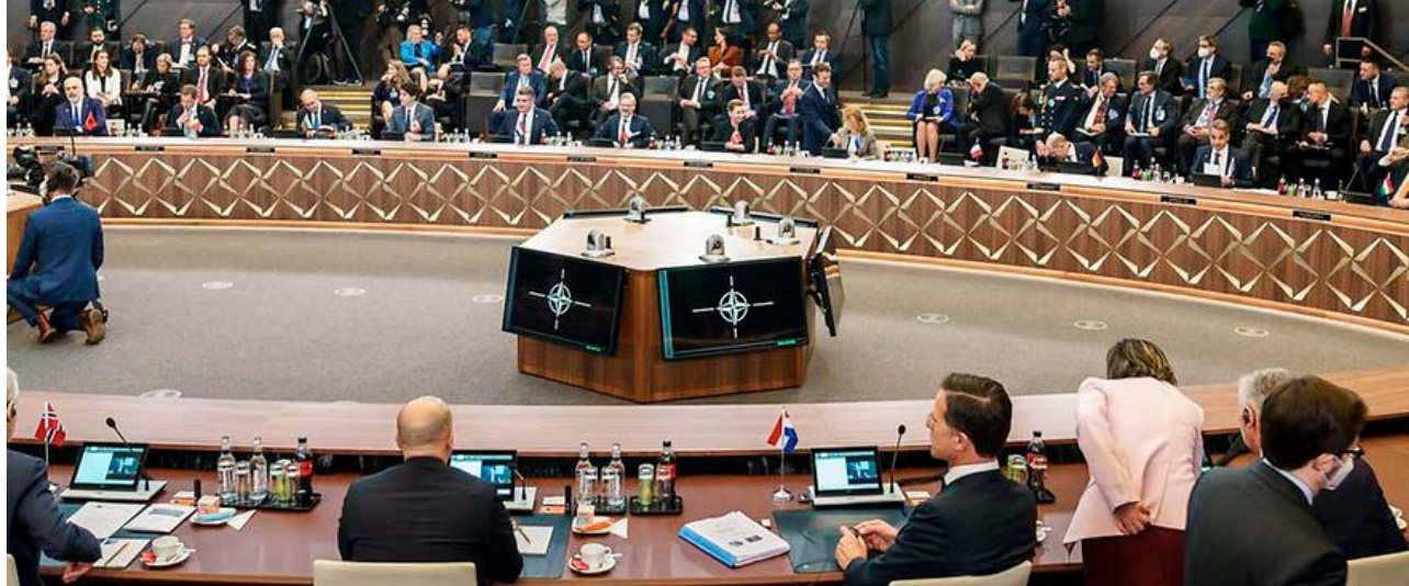
NATO extraordinary summit on the 22 March 2022

already started in 2021. In the past weeks German politicians have repeatedly underlined that the escalation in Ukraine should be a warning for the Western Balkans.