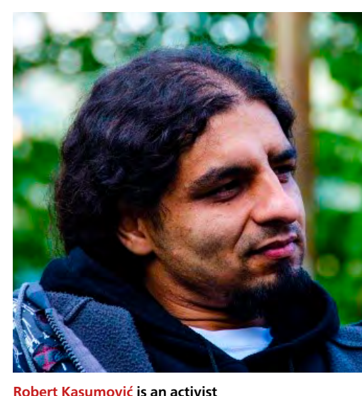
of the Roma Forum of Serbia and a member of the editorial board of the internet portal »Mašina«.

All the facts listed above indicate that Roma and Roma women in particular, are at the mercy of all problems rising from the introduction of a state