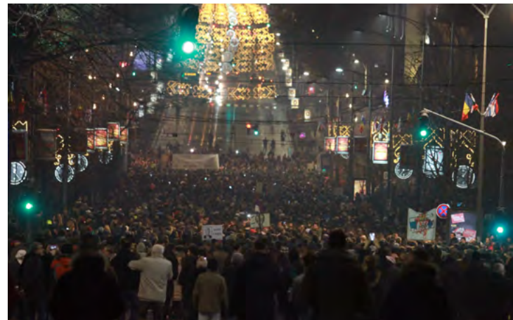
Anti-government protest in Serbia on December 22, 2018

Albania has also seen a rather unexpected bout of popular protests. At the beginning of December, students took to the streets of Tirana and other towns in protests at a rise in tuition costs approved by the government. Similarly to Serbia, attempts by Prime Minister Edi Rama to dismiss the protests – referring to demonstrating students as 'grade failers' – only stoked an-