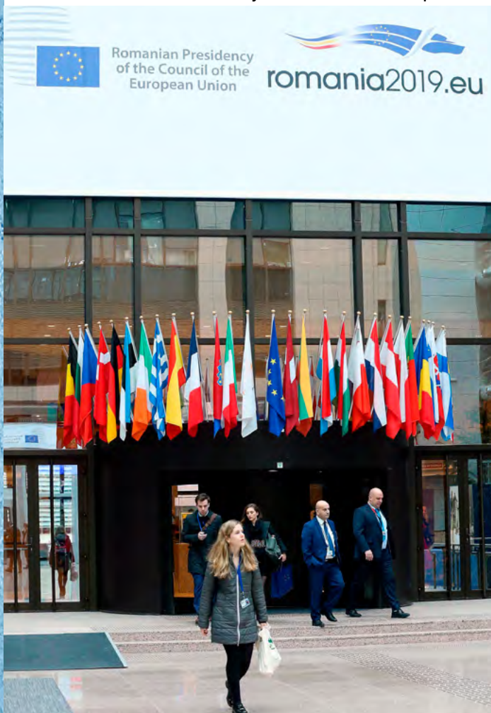
Romanian Presidency of the Council of the European Union

During the December European Council, Serbia and Montenegro both opened new negotiating chapters. Serbia opened chapters 17 (Economic and Monetary Policy) and 18 (Statistics), although officials in Belgrade had been hoping more would be opened. Observers in Belgrade warned that, with only 16 of 34 negotiating chapters opened at present, membership remained a distant hope. Meanwhile, Montenegro opened the challenging Chapter 27 (Environment and Climate Change), bringing its total opened chapters to 32 out of 33.