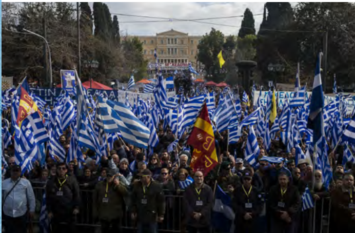
Demonstration in Athens on January 20, 2019

The visit of Russian President Vladimir Putin to Serbia on January 17 was testimony to the good relations between the governments of Russia and Serbia , as well as the personal popularity enjoyed by Putin in Serbia. The ruling party organized a welcome rally for the Russian President, attended by more than 100,000 party loyalists. Serbia's President Aleksandar Vučić did not miss any opportunity to roll out the red carpet for Putin throughout the visit, hoping that the Russian President's popularity in Serbia would rub off on him as well. Putin responded by awarding Vučić with the Order of Alexander Nevsky. Aside from expressions of brotherly love, the visit also had its more tangible moments. At least 20 bilateral agreements and memorandums were signed, ranging from more down to earth agreements in the energy sector to more lofty ones regarding space exploration and cooperation.