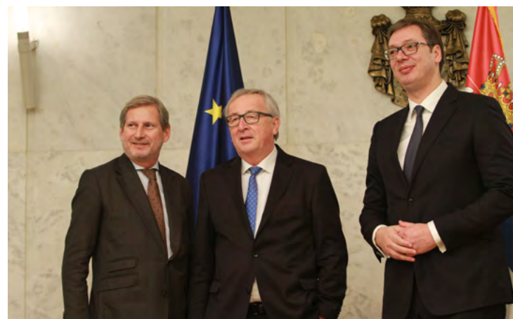
Jean-Claude Juncker and Johannes Hahn in Serbia

In Serbia, the long-awaited Belgrade City elections were held on 4 th March. The election was seen as a potential challenge for the ruling Serbian Progressive Party (SNS), which has traditionally enjoyed lower levels of support in Belgrade than in the rest of the country. In the end, the SNS triumphed, securing 45 % of the votes cast. And while an opposition coalition led by former Belgrade mayor Dragan Djilas came top in the fragmented opposition camp (19 %), the once mighty Democratic Party (DS) failed to pass the 5 % electoral threshold.