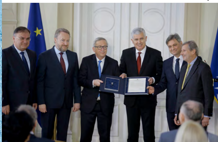
Jean-Claude Juncker and Johannes Hahn in Sarajevo

vote at 24 polling stations. According to media reports, around 74,000 of them cast their ballots, with 96.4 % reportedly voting for Vladimir Putin.