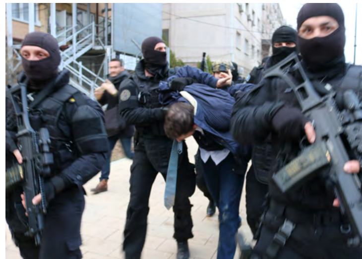
Kosovo arrests Marko Djuric for illegal entry

On March 26 th , special police units were deployed in north Kosovo in order to prevent Djuric from entering through the formal crossings, yet despite this Djuric found a way to slip into northern Kosovo and arrive at a meeting which was meant to be part of the Serbian government's process of internal dialogue on Kosovo. Present at the meeting were around 50 representatives of the Serb community in Kosovo, including several ministers in the Kosovo government. Special police units burst into the venue where the meeting was being held to arrest Djuric. In the process, guns with seemingly live ammunition were pointed at gathered civilians who scuffled with police, while those attending the meeting were beaten and hit with automatic weapons by the police. Djuric was taken to Pristina in handcuffs,