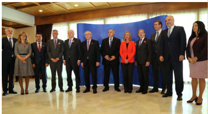
EU-Western Balkans summit in Sofia

Six new ‘flagship initiatives’ for transforming the Western Balkans were also singled out. Some of them – such as strengthening the rule of law or improving good neighbourly relations – were not particularly new. Yet others, such as rolling out a digital agenda for the Western Balkans were novel. This will include a roadmap for lowering the costs of roaming in the region among other things. There will also be a focus on supporting the deployment of broadband in the Western Balkans, as well as the development of eGovernment, eHealth and eProcurement. This new focus appears to be in sync with other regional initiatives. As part of the wider Berlin Process, in April the 1 st Western Balkans Digital Summit will bring together government officials, business people, IT industry representatives and academia in Skopje. On the agenda will be digital connectivity, digitization of industry and integrating Balkan economies into the Digital Single Market. Civil society organizations such as the Adriatic Council are also not sitting idle. On 22 nd March, they organized the Beyond 4.0 conference in Belgrade, one of a series of planned conferences to raise awareness about digitalization, artificial intelligence, ways in which they will impact the economies of the Adriatic region and what the countries of the region need to do to prepare for that.