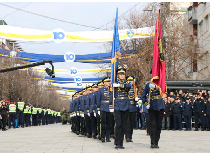
A marching band parades during the celebrations of the 10 th anniversary of Kosovo Independence in Pristina, Kosovo

Meanwhile, Albanian Prime Minister Edi Rama continued to rock the boat of regional relations, this time by suggesting that Albania and Kosovo could have a common president in the future. The suggestion was met with scepticism in Pristi-