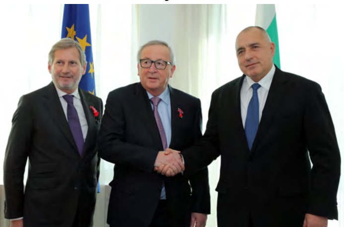
Boyko Borisov meets Jean-Claude Juncker and Johannes Hahn during the EU-Western Balkans summit in Sofia

All in all, the new enlargement strategy sends a clear signal that the main obstacle to Western Balkan accession to the EU will not be reluctance by existing members to allow new members into