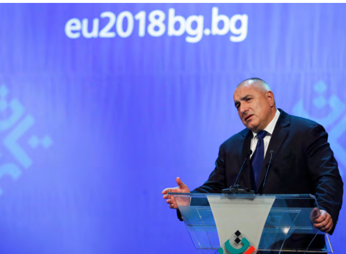
Bulgaria's Prime Minister Boyko Borisov speaks during the ceremony as part of the Bulgarian presidency of the Council of the EU

Among other things, Bulgaria hopes to champion the cause of Western Balkan EU enlargement during its six month Presidency. Quite whether Bulgaria is the best advocate for EU hopefuls in the Western Balkans is dubious at best. However, in February, the European Commission is due to unveil a new enlargement strategy focused on Montenegro and Serbia, the two current front runners, which, according to leaked information, seems set to float 2025 as a potential moment for the accession of these two countries. Doubtless, the new strategy will also list all the daunting work which they will need to complete by then in order to be ready to join.