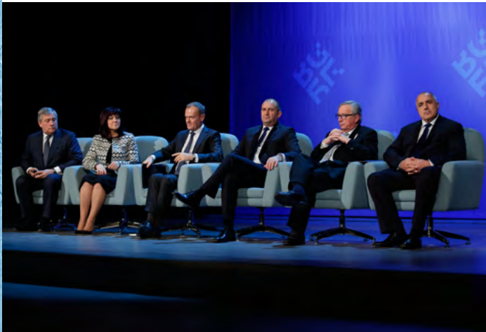
Jean Claude Juncker, Boyko Borisov, Donald Tusk, Rumen Radev, Antonio Tajani and Tsveta Karayancheva attend the ceremony as part of the Bulgarian presidency of the Council of the EU

largement strategy, which is both an attempt to breathe more life into the process, as well as boost the credibility of the promise of membership for the Western Balkan countries. The new strategy correctly identifies the problems plaguing the region and spells out what the countries of the region need to do in order to become members of the European club. In this sense, the new strategy is also a carefully calibrated attempt to dispel the idea that some countries might be let into the EU even if they do not meet the necessary criteria particularly if, like Serbia, they have a political bargaining chip up their sleeve (specifically, the Kosovo issue). Of course, this message is not intended just for Western Balkan ears but also those of the more enlargement-sceptic EU member states, who need convincing that the Commission is still serious about demanding that future accession countries really do meet key standards such as those relating to rule of law and fighting corruption.