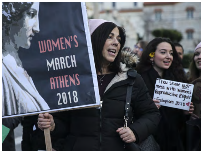
People participate in the Women's March rally on January 20, 2018 in Athens, Greece

Bulgarians also took to the streets over a number of issues in January. Indeed, the beginning of Bulgaria's Presidency of the EU Council occurred amidst protests by numerous local groups, such as police unions, seeking to exploit Bulgaria's moment in the international spotlight to draw attention to their own causes and problems. Aside from socio-economic problems, green issues also sparked demonstrations, as thousands came out onto the streets of Sofia on January 4 to protest against a planned expansion of a ski resort in the Pirin National Park. In another corner of the country, demonstrators supporting the ski development gathered at a counter-protest against what they called the 'green parasites'.