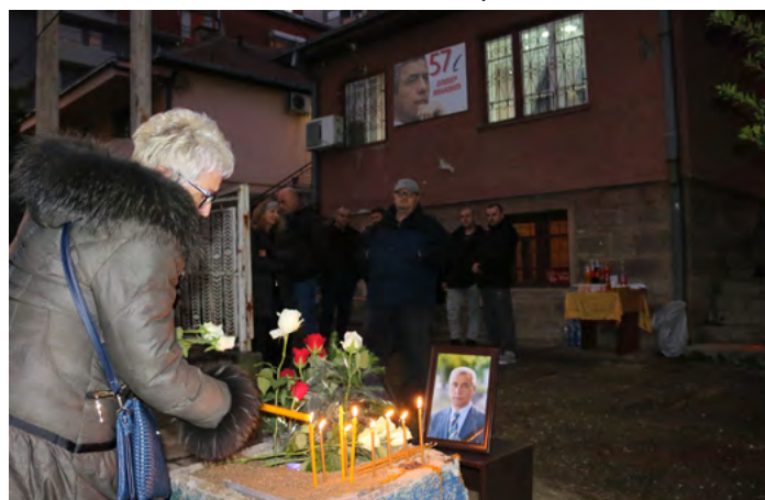
A woman lights a candle where Kosovo Serb politician Oliver Ivanovic was killed in northern town of Mitrovica, Kosovo

Nor was this the only turbulent development facing Kosovo over the holiday period. With the long-awaited Hague-based Specialist Chambers for trying crimes committed by the Kosovo Liberation Army (KLA) seemingly set to issue its first indictments in the very near future, a motion was submitted to the Kosovo Assembly signed by 43 (out of 120) of its members calling for the legislation which allows the Court to operate to be revoked. This sudden turn of events generated sharp rebukes from the international community, which warned of grave consequences if Kosovo's Assembly went down this path. Another attempt to have the relevant laws revoked failed on January 17.