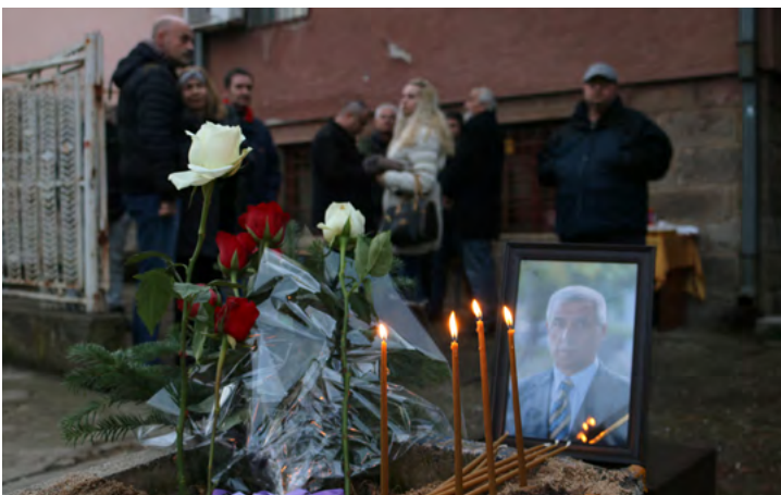
People gather at the office, where Kosovo Serb politician Oliver Ivanovic was killed, in northern town of Mitrovica, Kosovo

Who Ivanovic's assassins might be has still not been revealed. The Kosovar and Serbian law enforcement agencies have launched their own investigations and Kosovo's Prime Minister Ramush Haradinaj even floated the idea of calling in the FBI. Yet despite this, many observers remain sceptical that the assassins will ever be identified. While some in Serbia were quick in