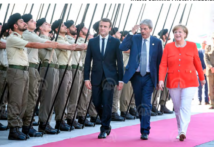
Trieste Summit.

To begin with, the summit served to reaffirm the EU's commitment to the eventual accession of the Western Balkans states to the EU, at a time when the EU's commitment to further enlargement is widely questioned, both in candidate countries but also inside the EU. The presence of German Chancellor Angela Merkel and French President Emmanuel Macron added further weight to the Summit. Merkel in particular stressed the importance of moving the Western Balkans candidate countries 'slowly but surely' towards EU membership.