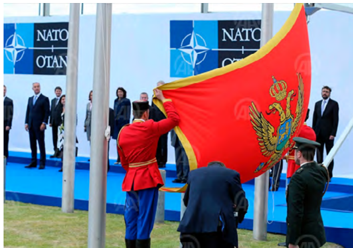
Montenegro's NATO accession.

Montenegro's NATO accession has also caused ripples in the region. The new Macedonian government has vowed to relaunch its country's own efforts to join NATO. Meanwhile, while public opinion in Serbia remains staunchly opposed to NATO membership, an increasing number of voices are beginning to argue that its proclaimed neutrality becomes ever more untenable with each neighboring country that joins the Alliance. Doubtless, Russia too will not rest, ramping up its efforts to prevent Serbia and Bosnia in particular from ever following in Montenegro's footsteps.