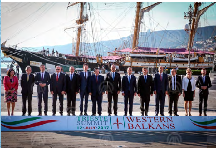
Trieste Summit.

Leaders from the Western Balkans candidate countries openly expressed their fears that the Berlin Process – and in particular ideas such as the Regional Economic Area – were being offered as an alternative to EU accession . In order to allay such fears, the final statement from the Summit underlined that the Regional Economic Area in particular 'is neither an alternative nor a parallel process to the European integration: it will reinforce the capacity of Western Balkans economies to meet the EU accession economic criteria, and to implement EU acquis on a regional scale before joining the EU'.