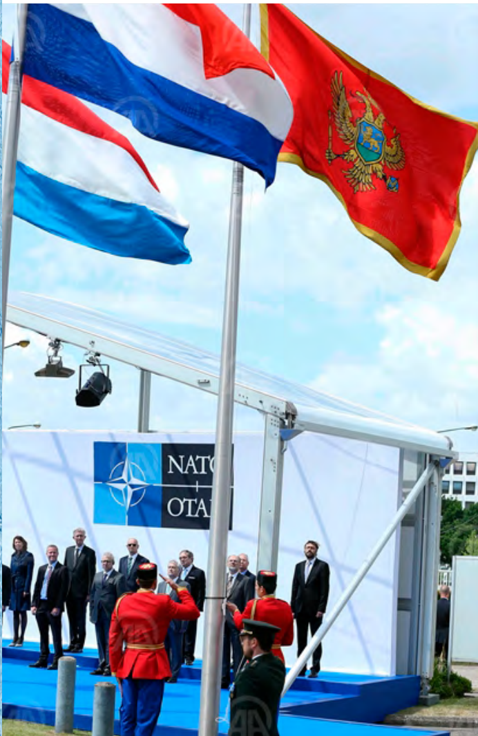
Montenegro's NATO accession.

the report warns, have travelled back to the region, bringing with them both dangerous skills and dangerous ideas. Evidence that the Islamist threat is not abstract or empty came at the end of June, although from a rather unexpected corner of the Balkans – Romania – where authorities arrested a 39-year-old Romanian citizen thought to have had links with the group which carried out the Paris terrorist attacks in 2015 as well as spying on a military base in Romania (which also included US personnel) in order to help plan attacks on the base.