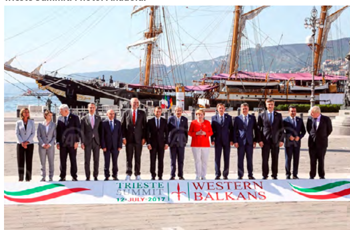
Trieste Summit.

In terms of the specifics agreed at the Summit, leaders from the region and EU representatives signed the Transport Community Treaty . The proclaimed goal of the Treaty is to create a fully integrated transport network within the region which would also be integrated with EU transport networks and aligned with EU operating standards and policies. In this way, the region would, among other things, be able to attract investments more easily. In addition to this, leaders of the regional signed up to a multi-annual Action Plan for a Regional Economic Area , aimed at easing trade, investment, and mobility within the region. Agreement was also reached on the creation of the Western Balkan Enterprise Development and Innovation Facility , through which the EU would seek to support the development of companies in the region. The Commission agreed to fund the Facility with a fresh 48 million euros.