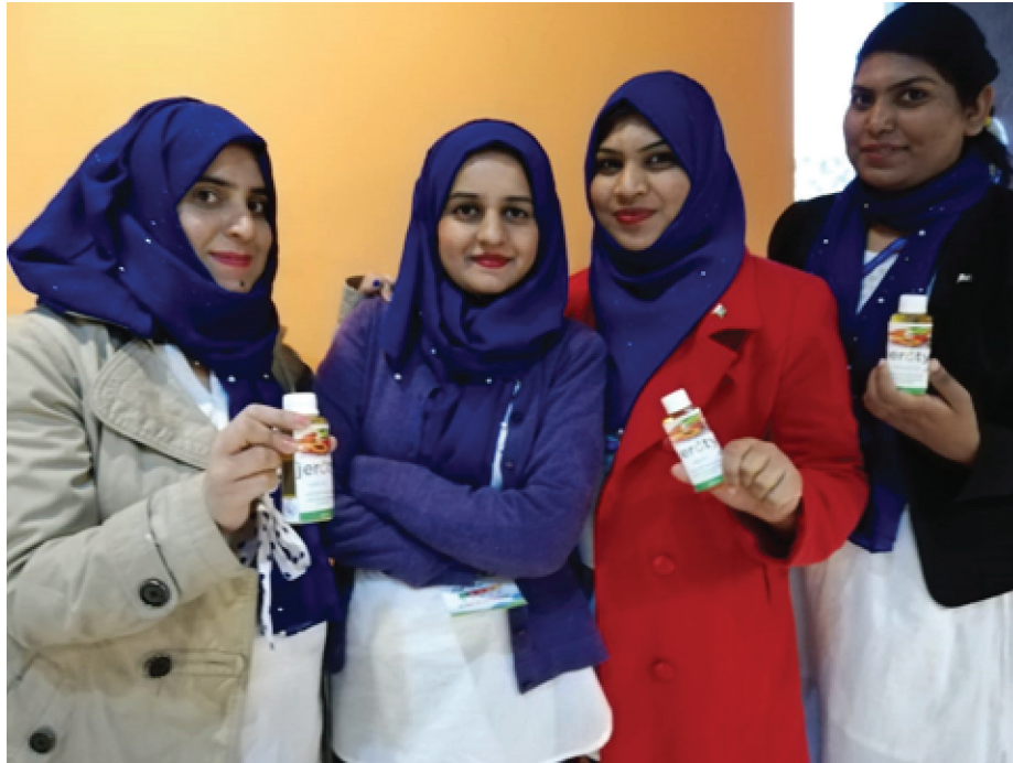
Jeroty started off as an idea developed for a university competition and the brand's products are now being sold to salons in Islamabad and Rawalpindi.

help them reprocess the dried fruit and then market the products. What was meant to be something that could help us win a university competition, is now a brand with products that we are selling at different salons in Islamabad and Rawalpindi”.