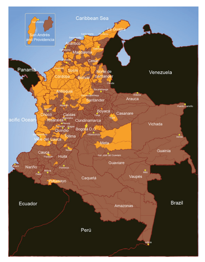
Urabeños area of influence, 2013.