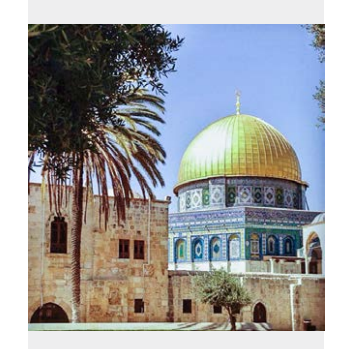
Possibilities for a change of the Status Quo at the Temple Mount / Haram Al Sharif in the second half of the year invoked violent clashes between Israelis and Palestinians in Jerusalem.