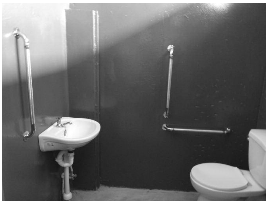
A bathroom that is fitted for persons with disabilities.

Further, trained staff at the shelters should be able to speak sign language and information made available on public notice boards. Communication limited to verbal conversations and transmission of information exclude this group of persons with disabilities. There is, too, an urgent need for an emergency text number that enables a speech-impaired person to trigger an alarm. 'We have been trying, but we could not get support to ensure that there is a 119 emergency service by text that deaf persons can access' (Goffe, CDA). 8