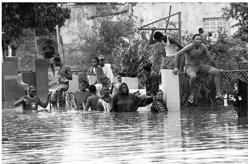
Natural disasters affect men and women differently.

Women, on the other hand, are responsible for providing and caring for the family, purchasing emergency items, preparing food, and taking care of the children and the elderly. It is reported that 47 per cent of households in Jamaica, for example, are headed by single women, many of whom are financially dependent on men. Paid construction work, which may become available after a hurricane, is mainly done by men so women have less possibilities for earning money after a disaster, despite the fact that households headed by single women are often larger than those headed by men. The result of women's gendered role is that they continue to stay home and care for the family and not to work outside, further increasing their financial dependence on men.