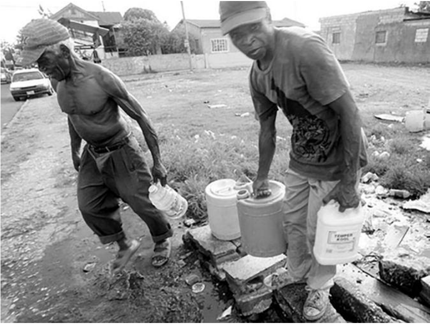
Men's gender roles in the post-disaster period are likely to be reinforced.

injury, but also to the possibility of earning additional income from post-disaster restoration activities.