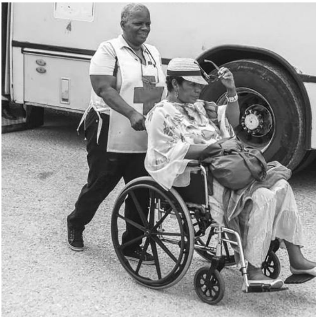
Shelters should be on the ground floor with proper ramps in place to ensure access.

Persons with physical impairment: It is very important that information and warning messages are announced in good time on TV, radio and through any other media, including social media. This is to ensure that sufficient preparation can be made for any approaching disaster. Shelters should be on the ground floor, with proper ramps in place to ensure ease of access. In addition, transportation to the shelters in case of emergency must be guaranteed. Many of Jamaica’s shelters still need to have ramps installed and other disabled friendly improvements made.