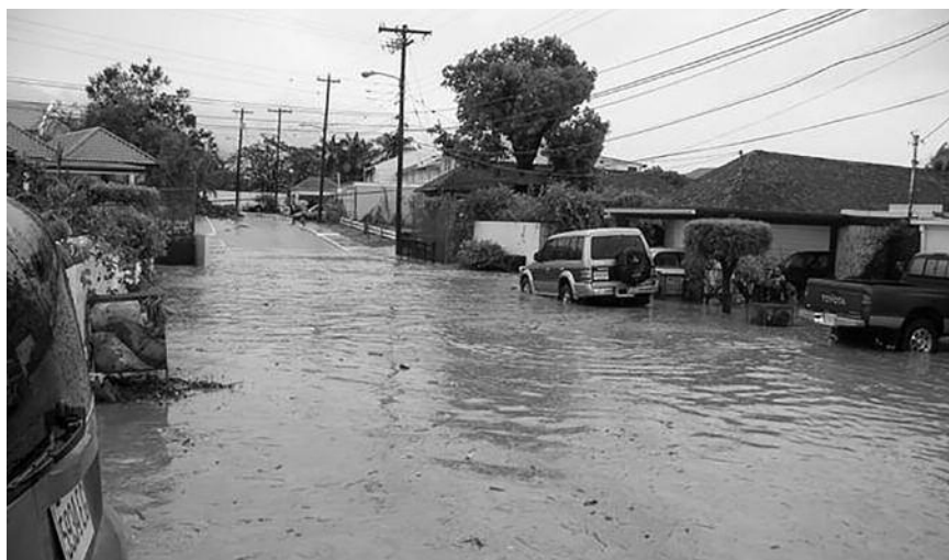
Severe flooding can destroy homes, cars and physical infrastructure.

This publication highlighted how persons with disabilities can be fully involved in emergency early warning systems which increase their capacity to protect themselves, and provide leadership for community interventions when a disaster strikes. It also demonstrated the value of partnerships, which allow pooling of human and financial resources for the training of persons with disabilities and of first responders, while providing support for the volunteerism which is central to the success of community initiatives.