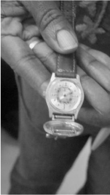
Visually impaired persons need timely information in a disaster.

Persons who are visually impaired: Clear and detailed announcements on television, radio and in print and Braille – made available in good time – are vitally important for ease of access to information. Persons who are visually impaired also need precise information about the location of the shelter and about unfamiliar routes. For example, familiar routes to the shelter might be destroyed or made inaccessible due to the disaster so that extra time and information is necessary for them to re-orient themselves, in case of an emergency. It is difficult for a visually impaired person to re-orient him or herself in a new environment so it is essential that they