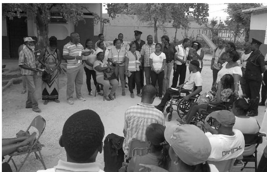
Participants in the first-ever simulation exercise for persons with disabilities at the Naggo Head Shelter, 2014.