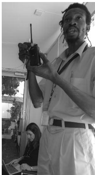
An ODPEM representative explains the emergency response system in Portmore.

Ten public service radio announcements have been done towards this end. The messages would highlight the response system in place and encourage registration so that vulnerable disabled persons can be reached as the EWS becomes a part of the national framework.