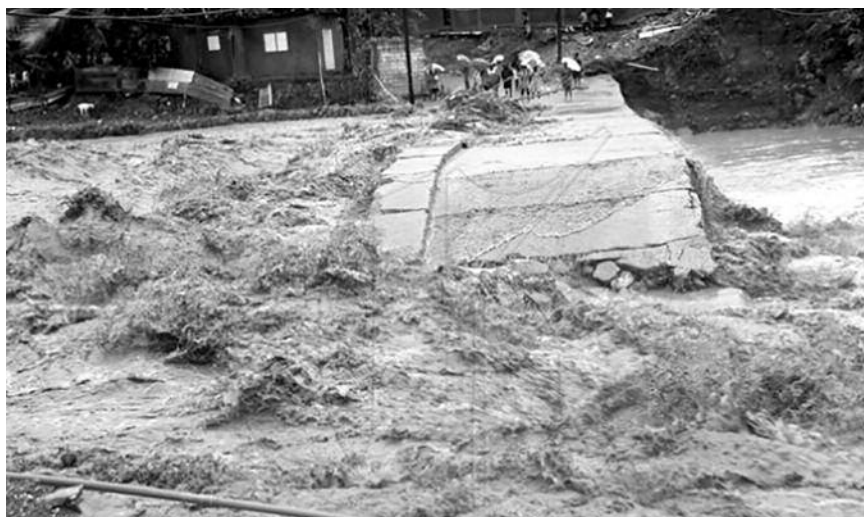
A bridge being swept away during flood rains which affect access to social infrastructure.

Mountainous communities provide livelihoods for subsistence farming families, and for important export agricultural sectors, such as coffee and bananas, as well as food for domestic consumption – the latter being critical to food security. The above-mentioned hazards often result in disruption in access to important social infrastructure, such as hospitals, as well as electricity supplies and road networks.