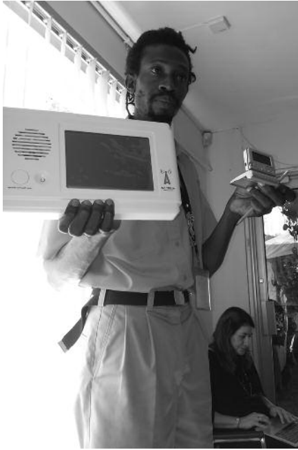
An ODPEM representative displays an alert system that reaches persons with disabilities.

Persons with hearing and speech impairments: Information and warning messages must also be announced in sign language on television to ensure that this community of persons with disabilities can receive and use this information.