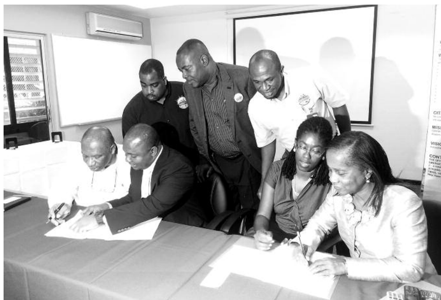
Representatives from the main partner organisations sign the Memorandum of Understanding for the Panos Disaster Risk and Climate Change Project.

men, and should guide the design and implementation of policies and programmes to build the resilience of families living in poverty.