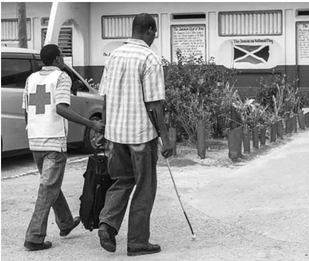
A Red Cross worker helps a blind man into the Naggo Head shelter during a simulation exercise.

receive the information concerning location and alternate routes to shelters in advance.