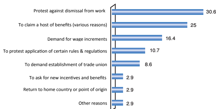
Causes of Protests%