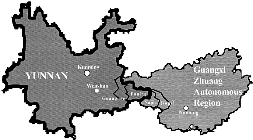
Map 2: Yunnan and Guangxi Zhuang Autonomous Region

in the Wenshan Zhuang–Miao Autonomous Prefecture. The discrepancies in Zhuang politics and ethnic identity on either side of the border are pronounced and can be directly tied to the fact that Zhuang within each territory have been governed by different provincial institutions. Local government policy is, of course, not solely responsible for the different interpretations of Zhuang ethnicity, as local authorities cannot entirely alter existing primordial loyalties among their governed population. 6 Yunnan and Guangxi officials faced different minority contexts when the Chinese Communist Party took control of the area and began implementing its minority policy. The manner in which the policy was implemented in Yunnan and Guangxi differed, however, and exacerbated the regional discrepancies in Zhuang ethnic identity. The territorial division of the Zhuang has encouraged a pronounced difference in ethnic identity and in official discourse on the Zhuang, and has encouraged regionalist sentiment over pan-Zhuang ethnonationalism. Examining the interaction between territorial and ethnic politics in Zhuang areas clearly illustrates how the Chinese central government has played these two potentially divisive tendencies off against one another in a manner which limits both, while purportedly promoting each.