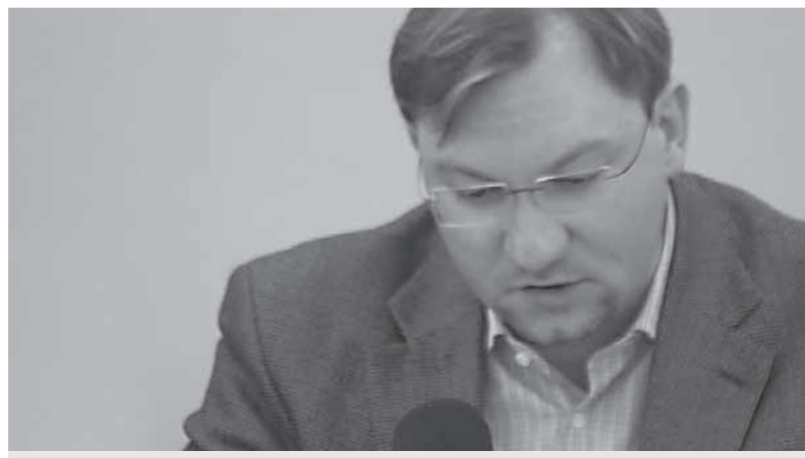
The Russian view on security cooperation was explained by Ruslan Pukhov.

argued that if Russia wanted to be treated like a great power, it should be willing to shoulder global and regional responsibilities and take positive initiatives, not only use its veto powers to foil international initiatives.