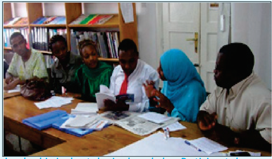
Leadership is about sharing knowledge. Participants learn how to solve various challenges that face them through sharing experience.

In the next Issue, we will continue sharing with you the articles from our trainees and some more beautiful colours from the first summer school held at Kibaha Conference Centre. You may also have the chance to see the faces of the people behind the FES