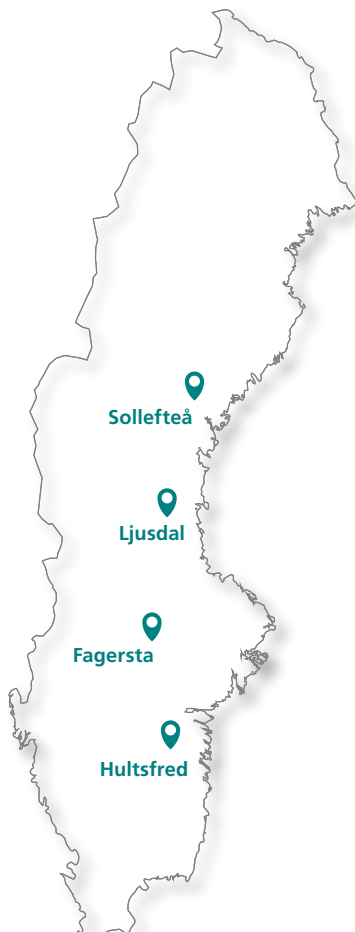
Figure 1 Map of Sweden with the four locations