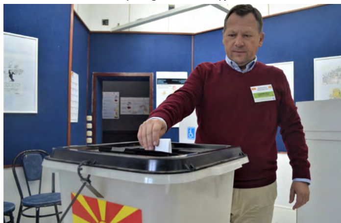
Voters cast their ballots at a polling station in Skopje

Such a vote, of course, requires a two-thirds majority – 80 of 120 MPs – in the Macedonian Parliament. The ruling coalition can muster the support of 71 by all accounts. The remaining 9 hands would need to come from the ranks of the VMRO-DPMNE. Some heavy arm-twisting, bargaining and haggling will doubtless ensue over the next few days. Zaev has clearly warned that, if the nine hands do not come forward, then an early election will be called in the hope of producing the necessary two-thirds majority.