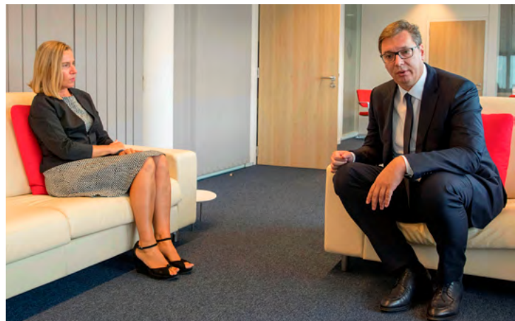
Federica Mogherini meets Hashim Thaci and Aleksandar Vucic in Brussels on September 7, 2018

Whether a deal is struck between Belgrade and Pristina or not, the tone of the talks between the two sides in this dispute stands in stark contrast to that between Greek and Macedonian officials. The announcement of the Greek-Macedonian 'name' deal came after months of positive, conciliatory messages from the leaders of both sides and was couched in terms of improving good neighborly relations. Meanwhile, the spin around a possible deal between Kosovo and Serbia was distinctly negative. In particular, Serbian President Aleksandar Vucic's rhetoric about