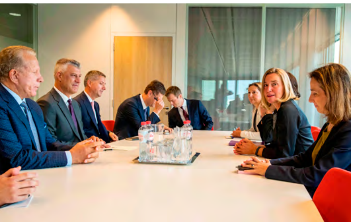
Federica Mogherini meets President of Kosovo, Hashim Thaci in Brussels on September 7, 2018

demarcating a border between Serbs and Albanians once and for all had the distinct echo of wanting to erect something more akin to a Chinese wall between the two nations than of laying the ground for improving relations.