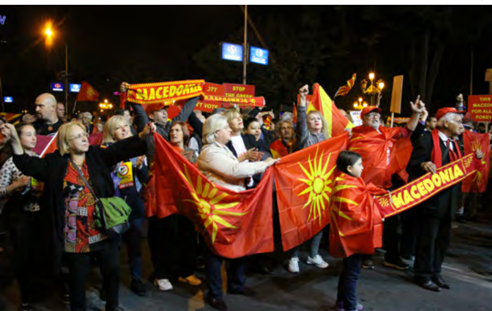
Supporters of a "boycott" for the name-change referendum celebrate the low voter participation in front of the parliament in Skopje

in favour of the 'name' agreement (and, by extension, unblocking Macedonia's EU and NATO accession path). Yet again, arguments about the unreliability of the Macedonian electoral register were brought to the fore, which includes a huge number of those who have emigrated from the country and cannot realistically be ex-