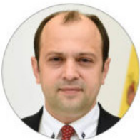
H. E. Oleg Țulea, Minister of Foreign Affairs and European Integration

“It is time to focus our efforts on differentiated integration..”