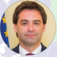
Nicu Popescu, Director of the Wider Europe Programme ECFR, Paris, former Min-ister of Foreign Affairs and European Integration