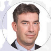
Dragoș Tudorache, Member of the European Parliament, Rapporteur of the European Parliament on the Republica Moldova (Renew Europe)