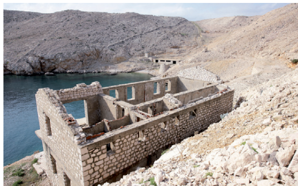
The remains of the women's camp on Goli otok.

Afterwards, the women were moved to the camp on Sveti Grgur island, where they spent about a year, from April 1950 until April 1951, after which they were transferred to Goli Otok, to a camp named Radilište 5 (Worksite 5, R-V). Here again they spent a year. During this time, although they shared the island with men, they had no contact with them. According to former inmates' testimonies, the two groups only occasionally sighted each other from afar. The women's camp on Goli Otok was situated at a particularly inaccessible location, with particularly severe weather conditions as it was exposed to constant bursts of wind. Similar to the administration structure of the male camps, the interrogators were women, and the living and working conditions were hard. After Goli Otok, the inmates were transferred back to the neighbouring island, Sveti Grgur, where they saw the dismantling of the camp system and their own return to freedom.