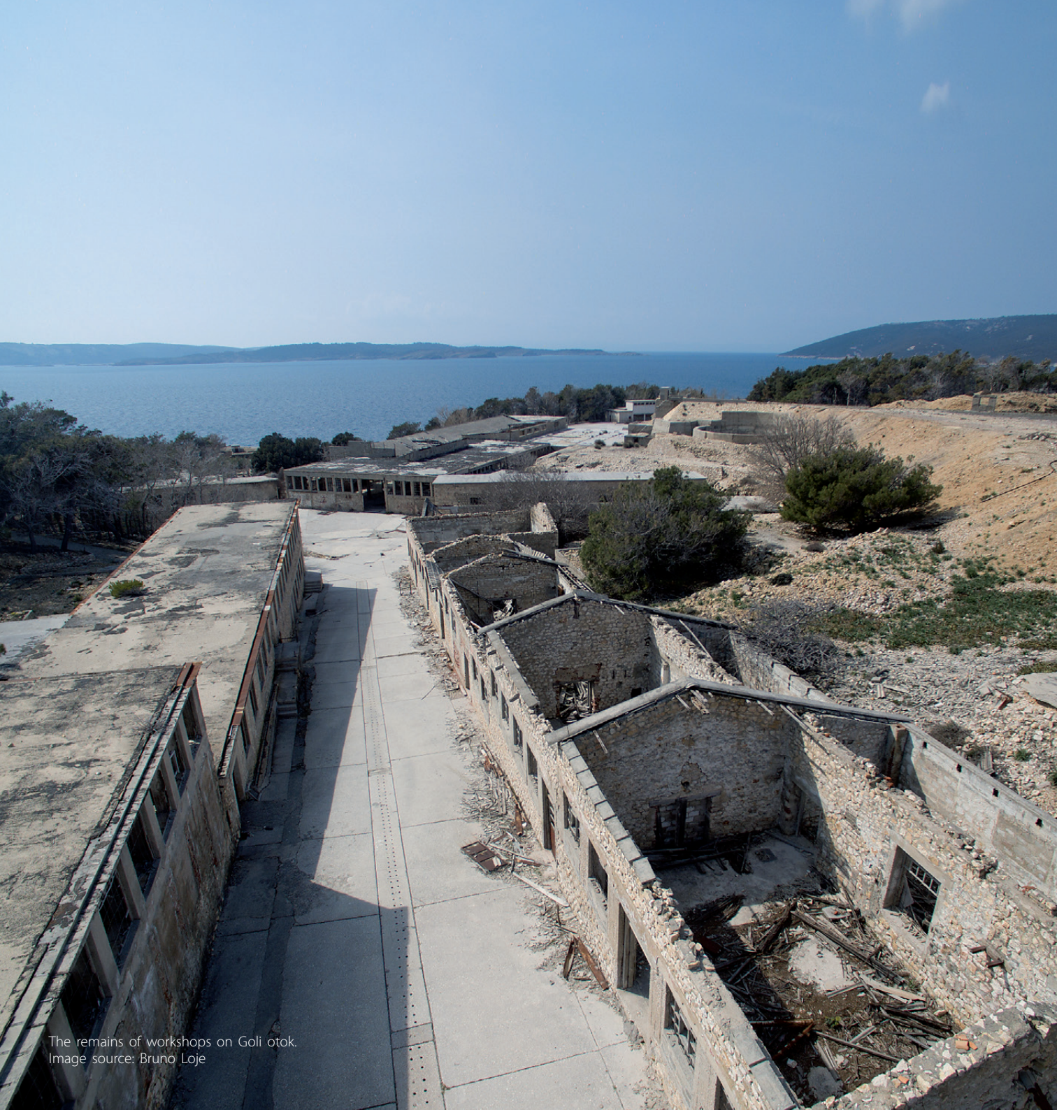
The remains of workshops on Goli otok.