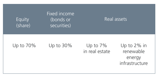
Figure 2. GPFG Investment portfolio

Just as important, although very recently created, Ireland Strategic Investment Fund's aim is investing and strengthening the domestic economy through innovation and employment. ISIF is a mixture of domestic and global investors. What makes ISIF distinct is its orientation towards supporting government programs such as Project Ireland 2040. Strategic national documents were combined to set the vision and implement an investment framework for Ireland 2040. The Project targets investments in five Priority Areas: Regional Development, Housing, Indigenous Businesses, Climate Change and Brexit. In September 2021, the Fund announced that its investment strategy over the next five years will be in climate action projects. Such projects will include renewable energy generation, and storage, energy efficiency and sustainability in performance like reducing countries' carbon emissions. Similar to Norway Government Pension Fund Global, ISIF is following trends in meeting global challenges towards climate change.