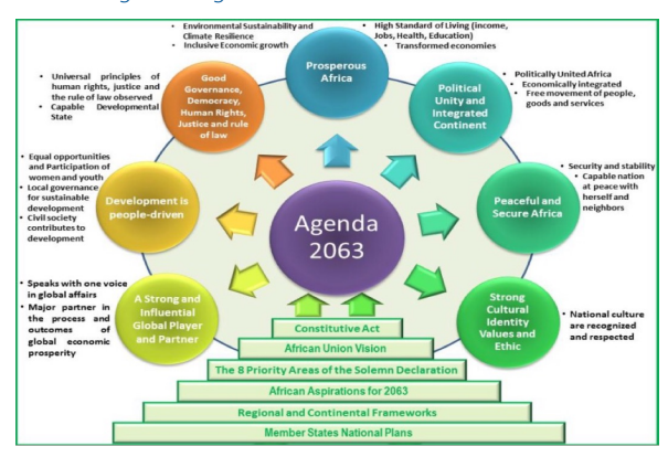
Figure 1: Agenda 2016 Framework Document<sup>5</sup>

9. The challenge is to determine how this innovative AU Agenda can transform the business landscape. Thus, the AU must take a strict stand on ensuring business respect for human rights.