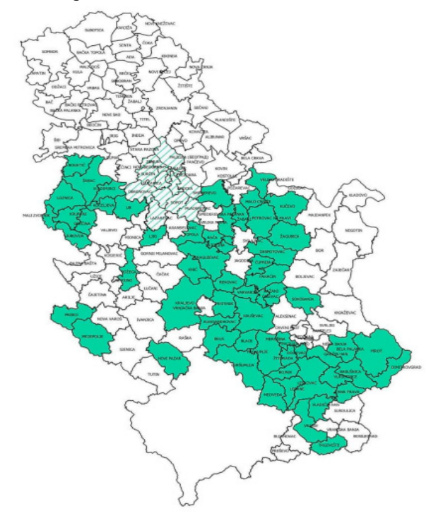
Figure 1 Map of Serbia showing which municipalities held early elections in 2023, in green<sup>12</sup>

Snap parliamentary, provincial, and local elections in the city of Belgrade and 64 other cities and municipalities, were officially called on 1 November and scheduled for 17 December. This decision was controversial due to the fact that regular local elections in these cities and municipalities, except Belgrade, were scheduled for the mid-2024 and due to a perplexing decision by the government to hold local elections only in around one-half of municipalities. While some early local elections were occasionally called in the past, calling so many of them without an apparent reason was unprecedented. After the elections in December, the decision started to be interpreted in the public as a part of the strategy of organized voter migrations from the municipalities in which elections are not held to the ones in which they are.