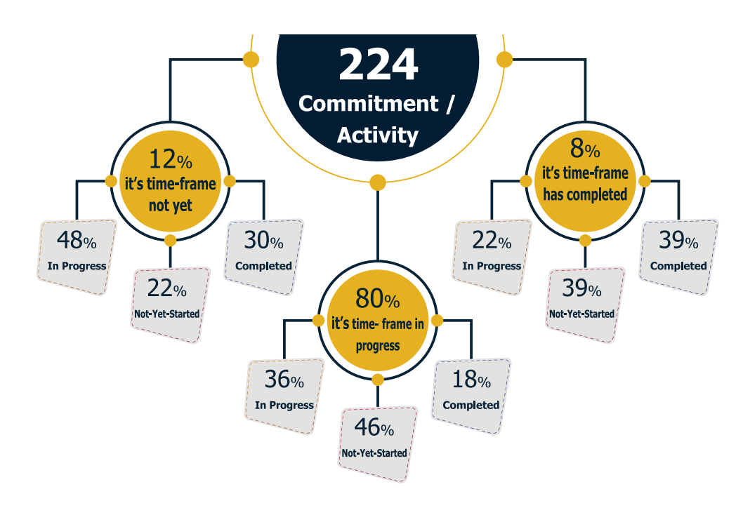
Graph 3. Level of Achievement of Plan Activities - First Pillar