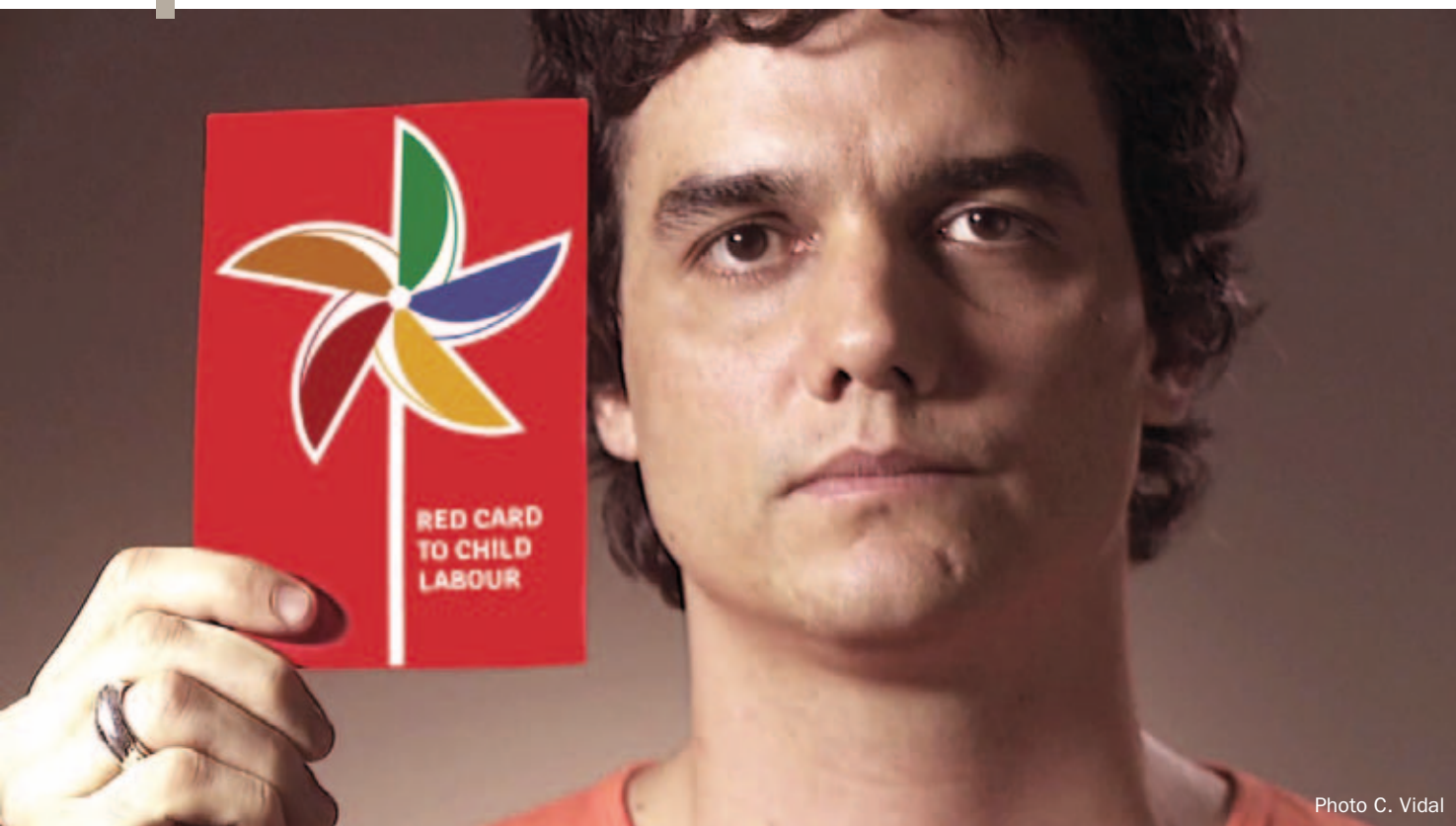
Brazilian actor Wagner Moura joins the Red Card Campaign