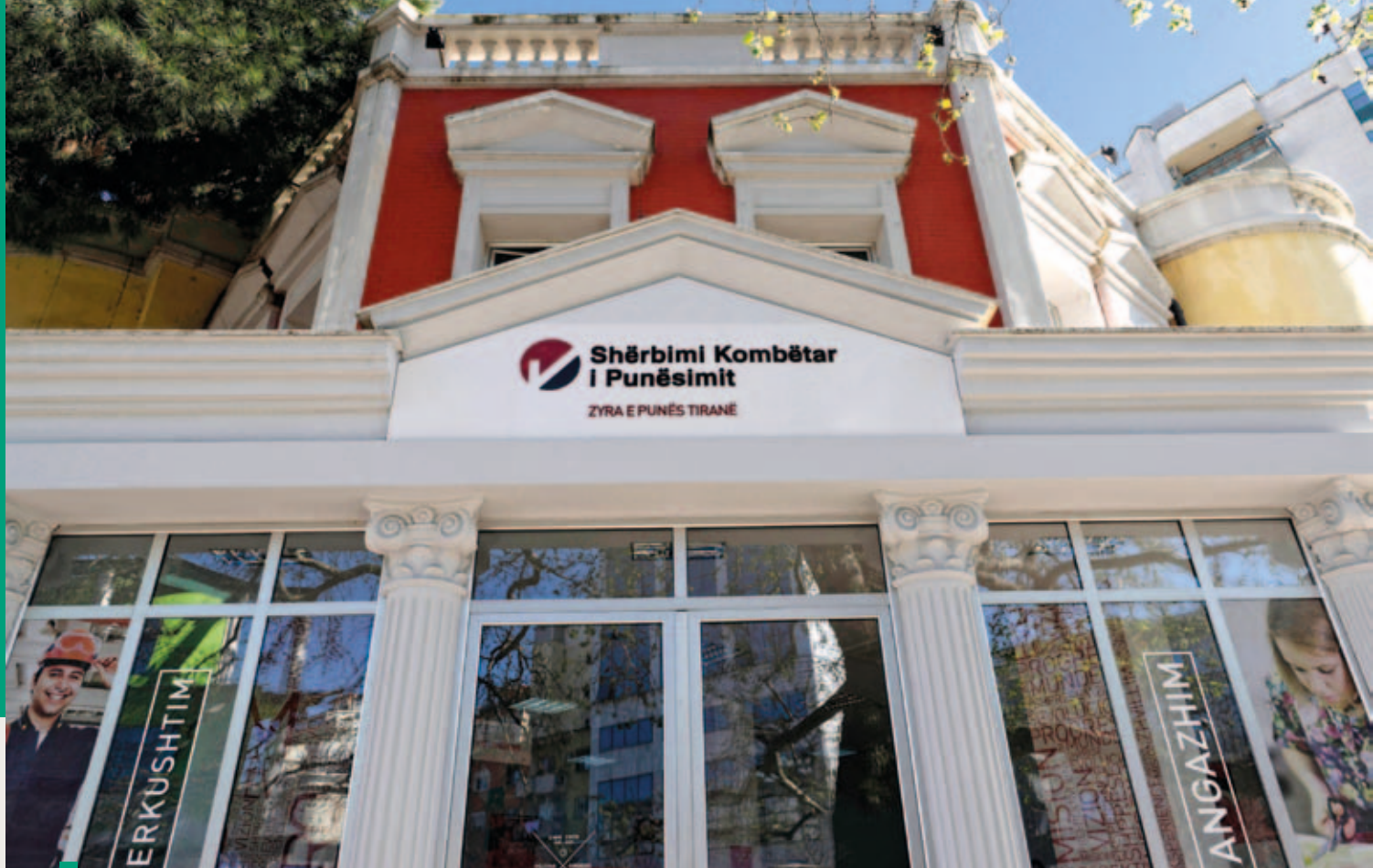
The first modern employment office in Tirana

The concrete and glass pyramid in the centre of Tirana, once a museum in honour of former dictator Enver Hoxha, is crumbling and abandoned.