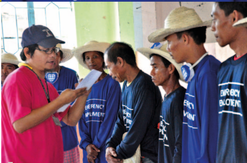
Typhoon survivors join the ILO emergency employment programme

“By doing so, we want to ensure that survivors of typhoon Haiyan are not forgotten in the recovery. They have been through trauma and pain of loss so it is crucial to ensure that they are not left vulnerable and exploited. They must not fall victims again as they start to rebuild their communities. Emergency employment should be as safe and decent as any other job.”