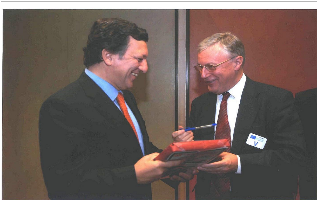
John Monks presented to José Manuel Barroso, President of the European Commission, the ETUC's petition for high-quality public services, which has already attracted 510,000 signatures

Please pass this newsletter on to your colleagues and contacts