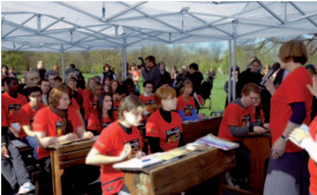
Students taking part in the World's Biggest Lesson outside the German Reichstag (Parliament Building). The GCE presented a school report card marking Germany's performance on Education for All.

"If you are illiterate, you could not help your own children do their homework."