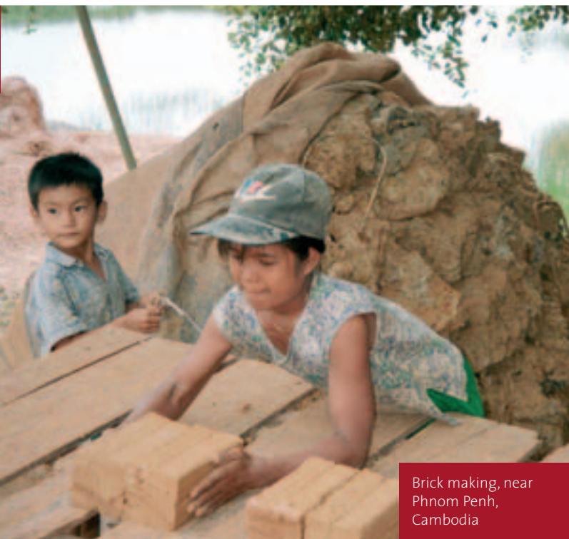
Brick making, near Phnom Penh, Cambodia