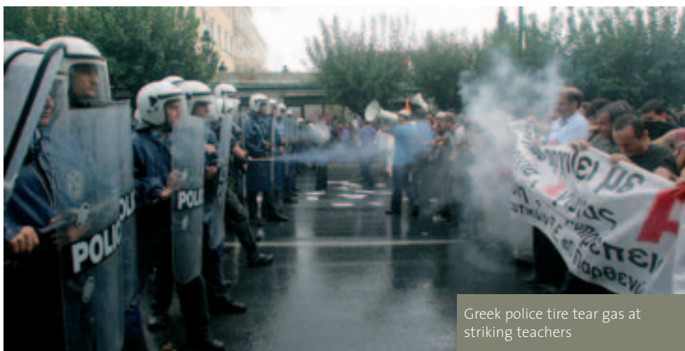
Greek police tire tear gas at striking teachers

Thousands of colleagues in the Federation of Secondary Teachers of Greece joined them on the picket lines for 12 days. The Hellenic Federation of University Teachers' Associations took to the streets in one-day strikes on a weekly basis. Students at more than 1,000 secondary schools staged sit-ins for more than three weeks. University students mobilized in strong support as