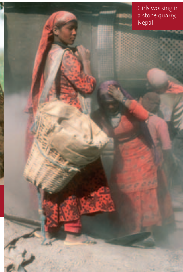
Girls working in a stone quarry, Nepal

In Morocco, the Syndicat National de l'Enseignement (SNE-FDT) carried out a child