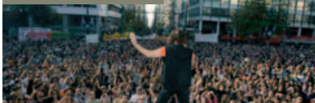
Concert in support of teachers' demands on World Teachers' Day