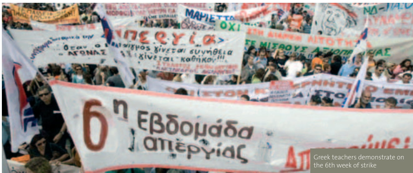
Greek teachers demonstrate on the 6th week of strike