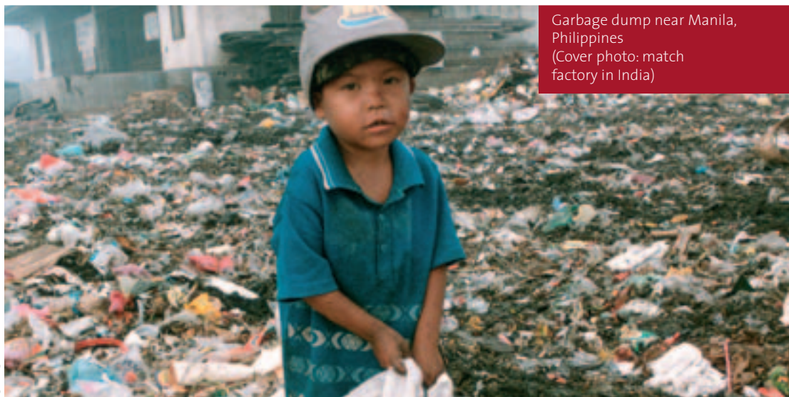
Garbage dump near Manila, Philippines (Cover photo: match factory in India)